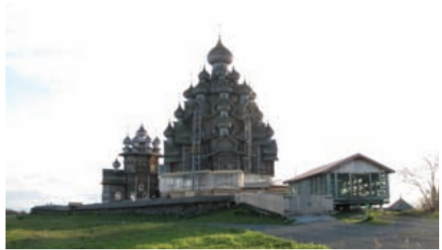
Conservation of the Church of the Transfiguration for the winter period 2012—2013

The Restoration Complex was put into operation in 2007. It has greatly changed the approach to restoration works. Modern and comfortable conditions allow carrying out the restoration works at a good level all year round regardless of weather conditions, which is impossible while working in the standard "field conditions".