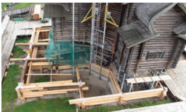
The restored tier exactly fit the foundation of the church

preserves height marks on the south church wall, but those on the remaining ones were moved upwards while straightening the whole building.