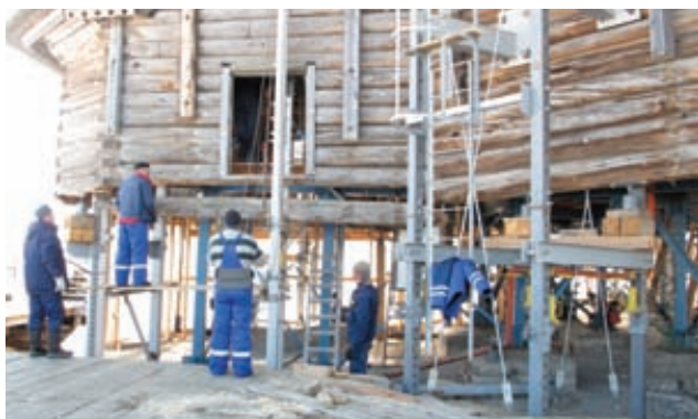
Dismantling of the walls in spring 2012

The process of disassembly was perfected in the earlier period. The disassembly of the dome and so-called ‘barrel’ roof above the altar was something experienced for the first time as well as the work on reassembling and disassembling performed simultaneously on the building.