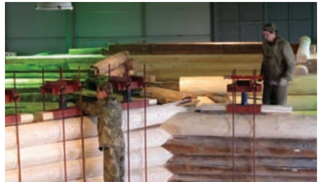
Simulation of loadings on the restored walls

Height marks of the building baseline (foundation + 7th tier) were changed according to project objectives during the reconstruction of the foundation and restoration of the 7th tier. For instance, two lowest log-sets, previously lost, were reconstructed after careful examination of the upper logs and graphical analysis. Consequently, the building grew appr. 600 mm higher. Central part of the 7th tier was deformed downwards to 400 mm due to heavy loads, and it was set horizontally during the restoration. The reconstructed foundation