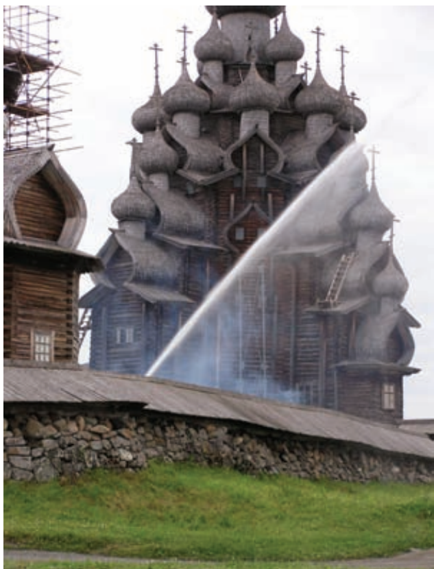
Checking the fire-extinguishing system of the Kizhi Pogost

Natural Disasters Response of the Republic of Karelia, and Subdivision of Ministry of Internal Affairs of the Republic of Karelia.