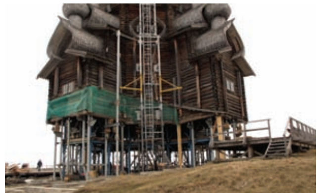
The prepared space for the assembly of the restored tier on the foundation