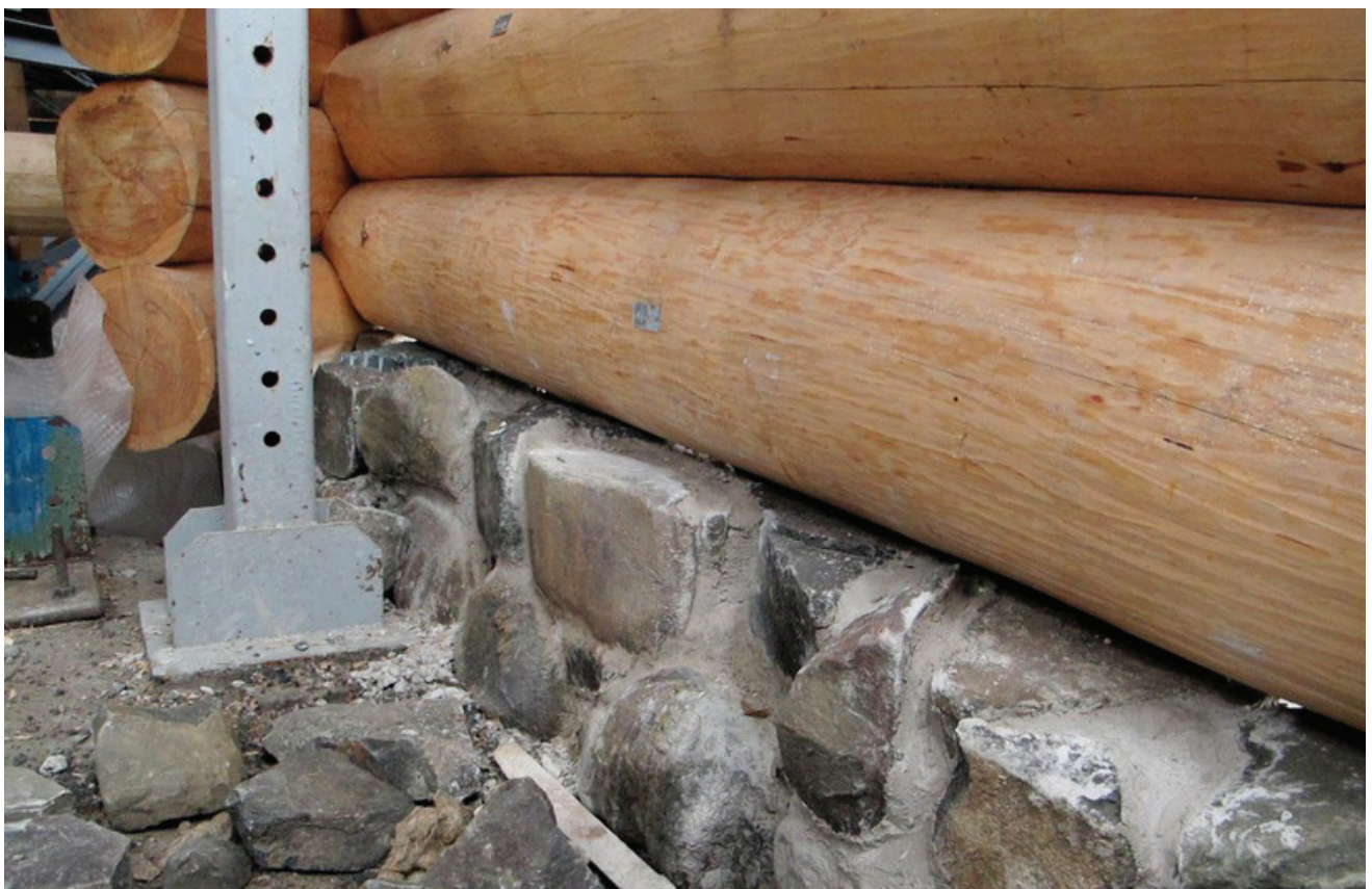
Assembly of the restored 7th tier