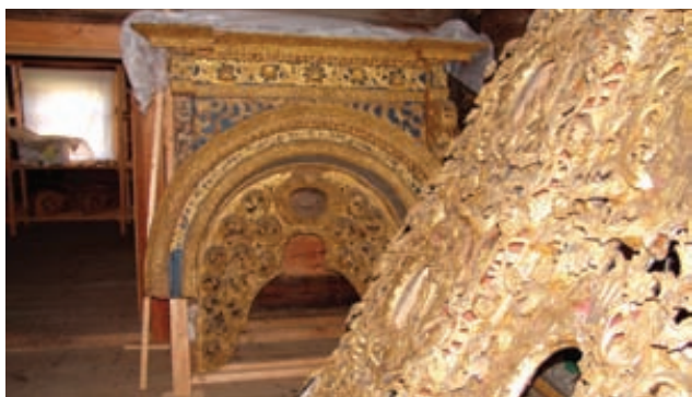
Restoration of the iconostasis

In 2012, the Kizhi Museum continued the restoration of the iconostasis frame of the Church of the Transfiguration concentrating the efforts on the Deisis tier. It was planned to perform the conservation of the gilded surface and restoration of wood carving and the frame. The contractor is the Moscow Art Research and Restoration Directorate. Cost of works is 15 653 170 RUB.