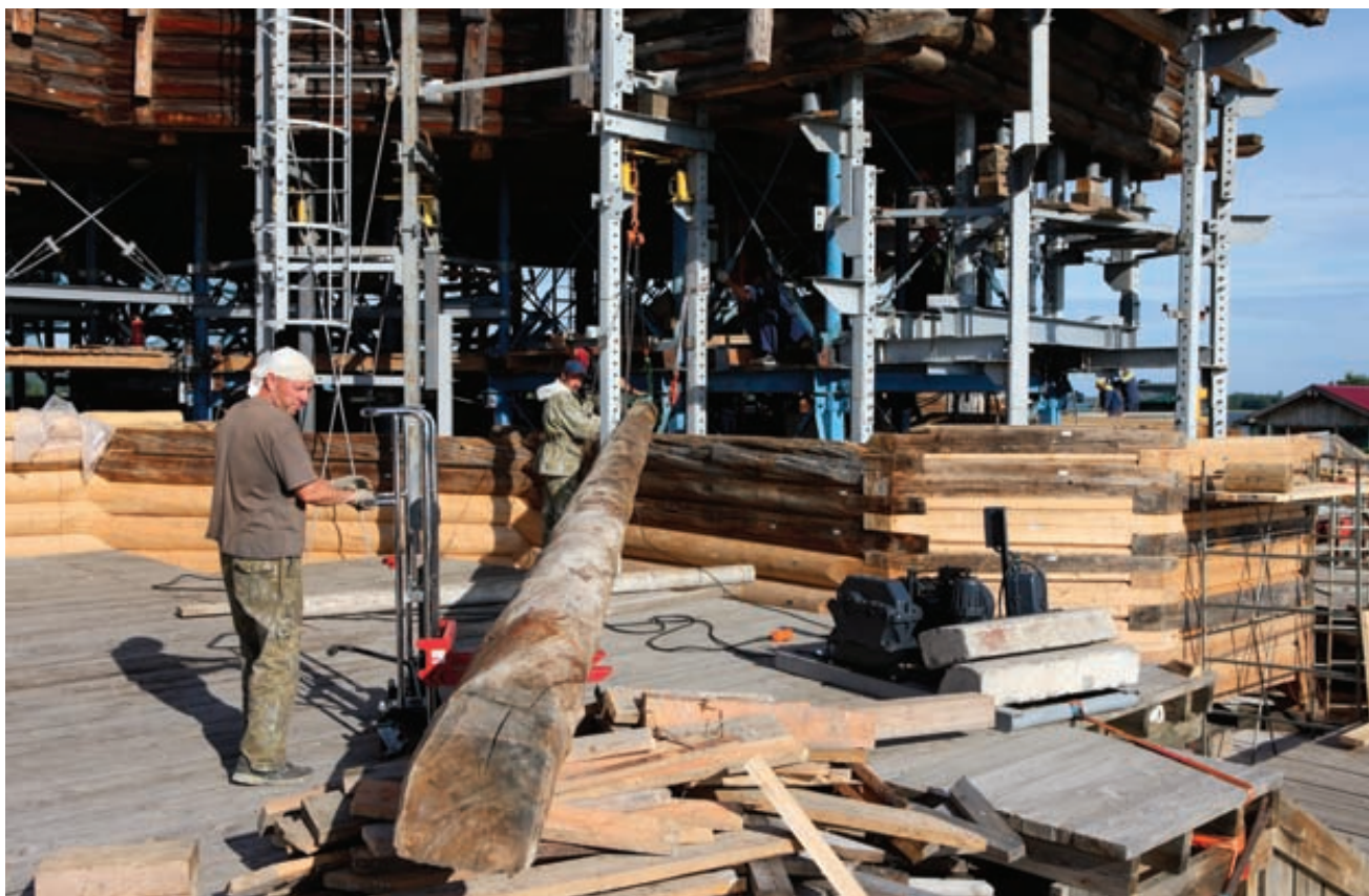
Assembly of the restored 7th tier