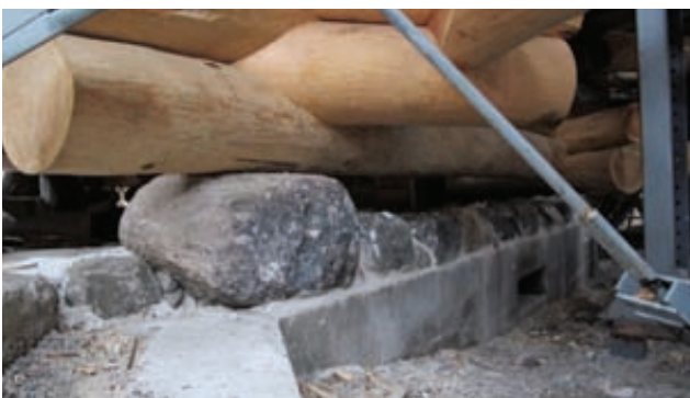
Boulders under the corners of the walls and stone filling between the boulders

As it was mentioned above, the walls of the basement were aligned along the floor groove, that is, along the upper logs. Accordingly, the indications of elevation of the lower logs (that are at the same time the indications of elevation of the upper part of the lime mortar stone foundation) became available at the end of August. The remaining warm period was not enough to complete the construction of the above-ground part of the foundation qualitatively, but the major works were accomplished exactly in 2012.