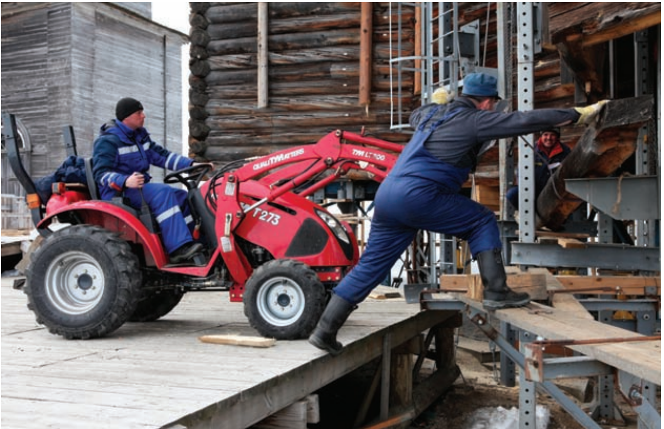
Disassembly of the 6th restoration tier