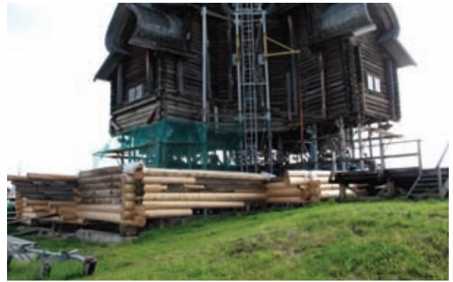
Assembly of the restored 7th tier on the foundation

After the walls of the basement part (7th tier) were completely assembled, the two upper log-sets were measured and taken to the Restoration Complex to base the next, upper tier during the restoration.