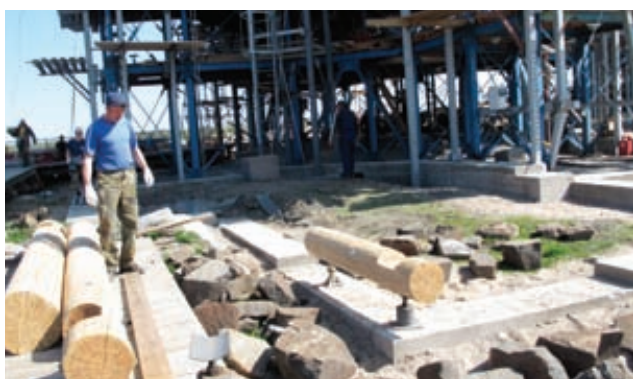
Installation of the first log on the foundation

The first log-set (i.e. several logs notched with each other in their ends forming the perimeter of a building) started with the 5th row of logs. Consequently, the four lower rows of logs were not complete log-sets (did not embrace the whole perimeter) and were built in a cascade way according to relief. In the process of the lower logs assembly it was decided to lay them exactly in the center of the strip foundations. Then, during placing the first complete log-set it was necessary to verify its geometry by checking it with the control points and, if necessary, correct it.