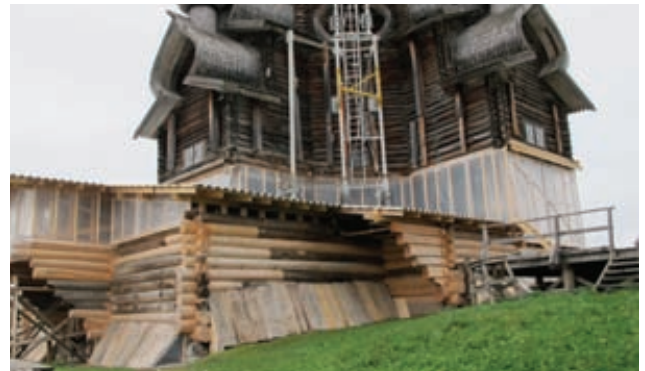
The fully assembled 7th tier (without two upper layers of logs)