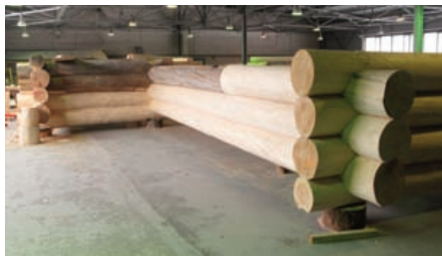
Reconstruction of the lost lower logs of the Transfiguration Church

The restoration and test-assembly of the 7th tier were started in 2011 in the Restoration Complex. Due to specific dimensions of the assembly department, the restoration tier was divided into two parts; the first one was restored and assembled in 2011, and the work on the second one was started in winter, 2012.