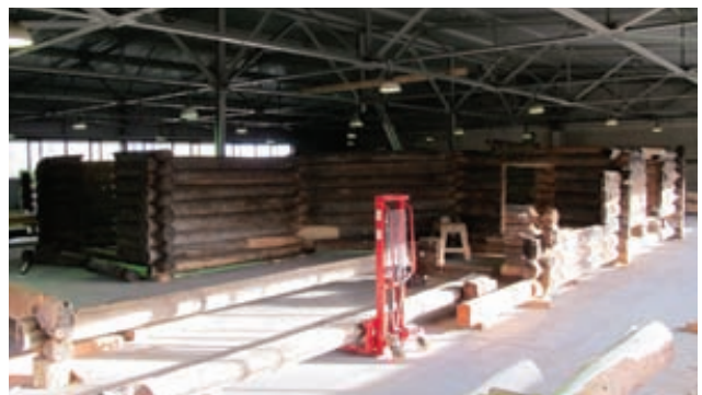
The test assembly of the 6th tier in the Restoration Complex