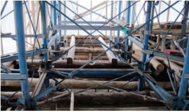
Adjustment of the position of horizontal metal beams of the metal frame

This experience was very useful as this situation (when wooden beams “overlap” with metal ones) can be repeated and it is quite possible that similar works will have to be done at other elevation points.