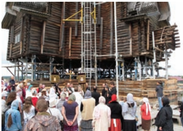
The feast of the Transfiguration of the Savior

The materials concerning the preservation of the Church of the Transfiguration are broadcasted regularly on different TV and radio channels in Russia.