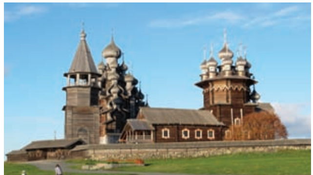
The Church of the Intercession of the Kizhi Pogost

Thanks to all of the above mentioned measures taken in 1998—2012 the classification of operating regime can be revised, i.e. 'Regular maintenance and preventive inspection' instead of 'Needs restoration continually'. The Kizhi Museum strives for decreasing large-scale repair and restoration work by increasing regular preventive measures. This is the true essence of preservation of the Cultural Heritage!