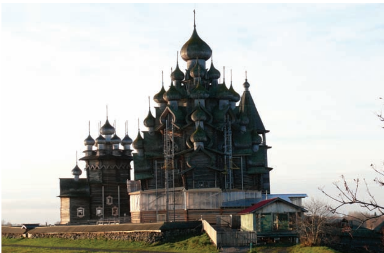
Conservation of the Church of the Transfiguration for the winter period