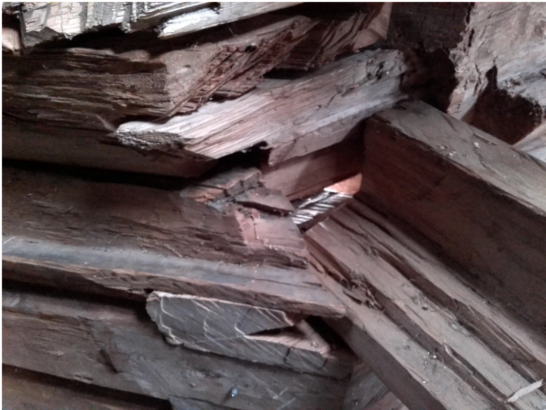
The supporting ring of the «heaven» ceiling. The joints of the beams spanning across the top of the annexes are broken, and have lost their function. The screw in the lower log is a point for monitoring.