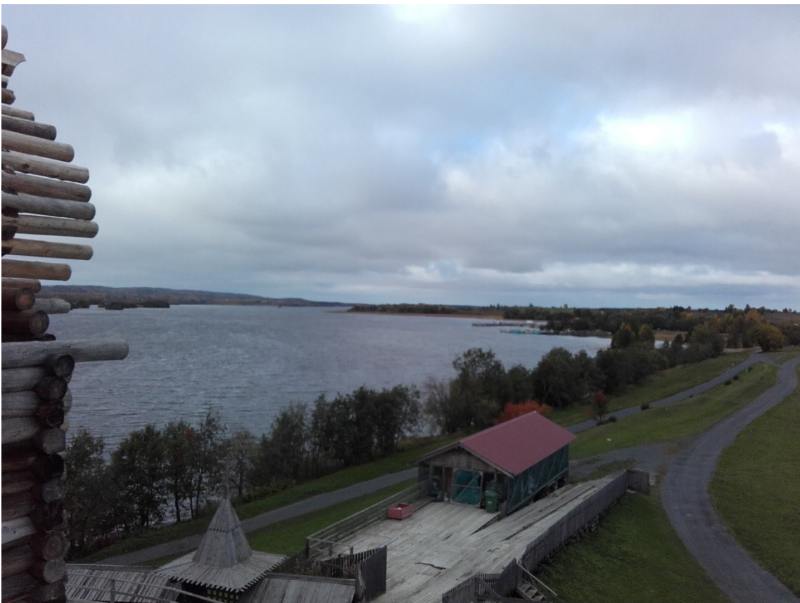
The big floating restaurant has been moved and is no longer visible from the pogost.