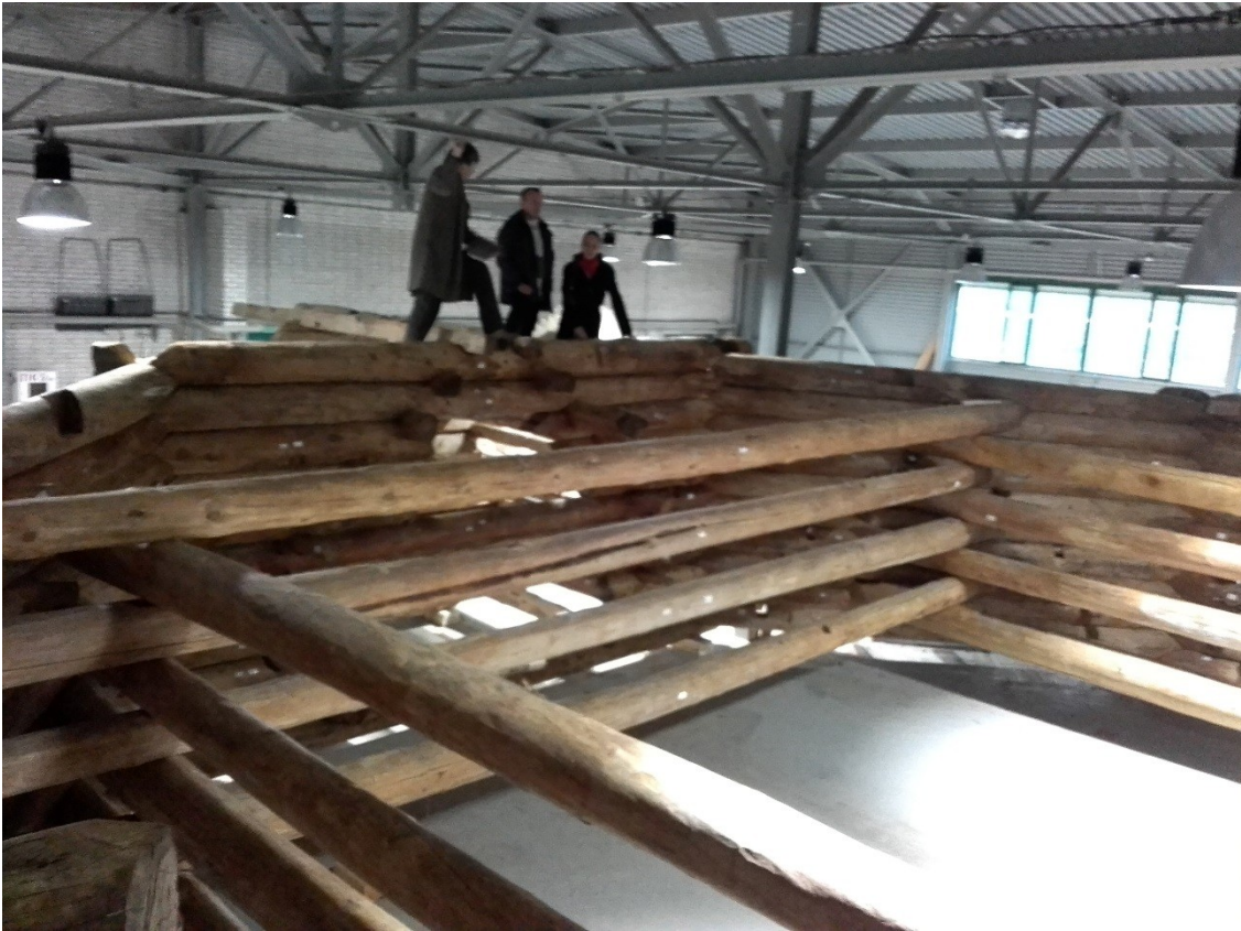
The quadrangle beam structure.