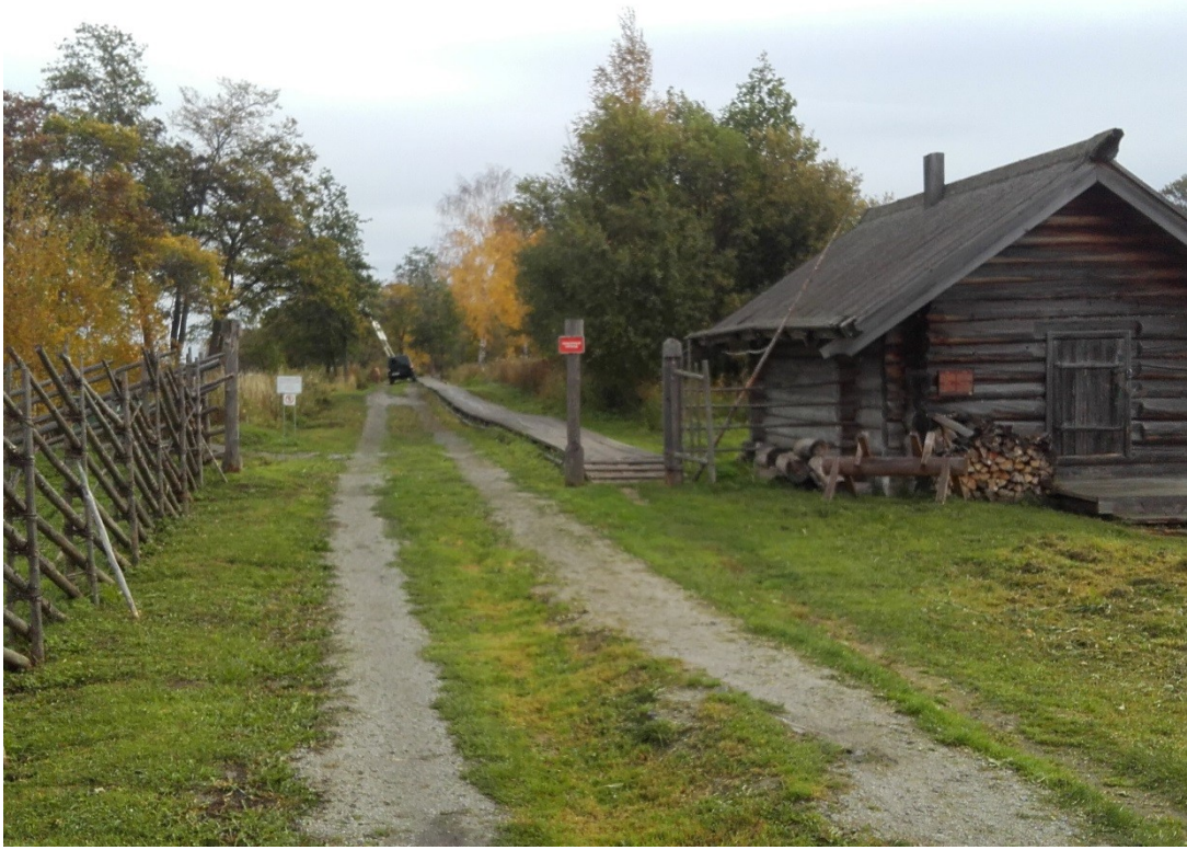
A piece of new road makes it possible to get closer to the guest house with a car.