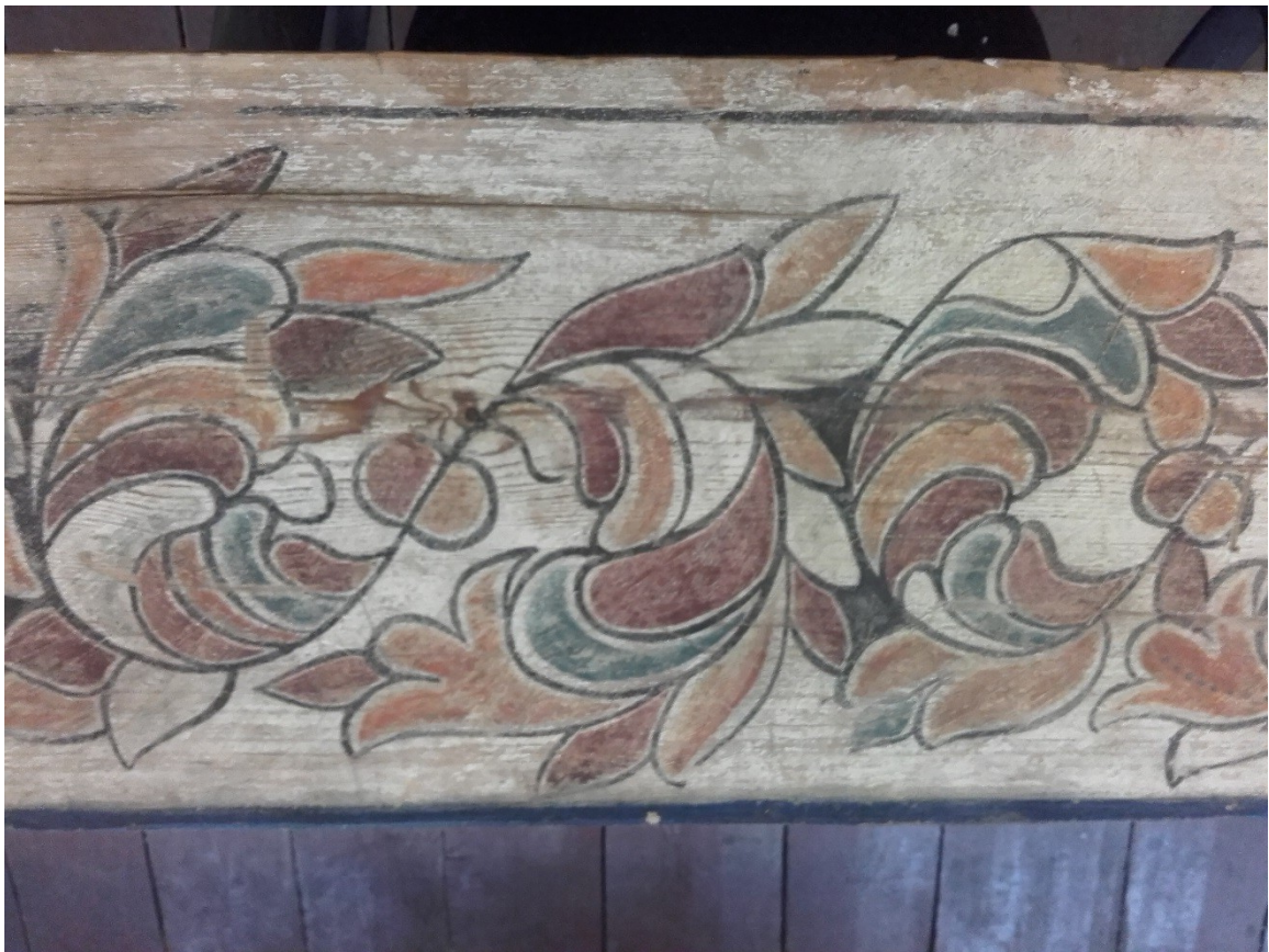
The decorated beams of the interior «heaven» ceiling.