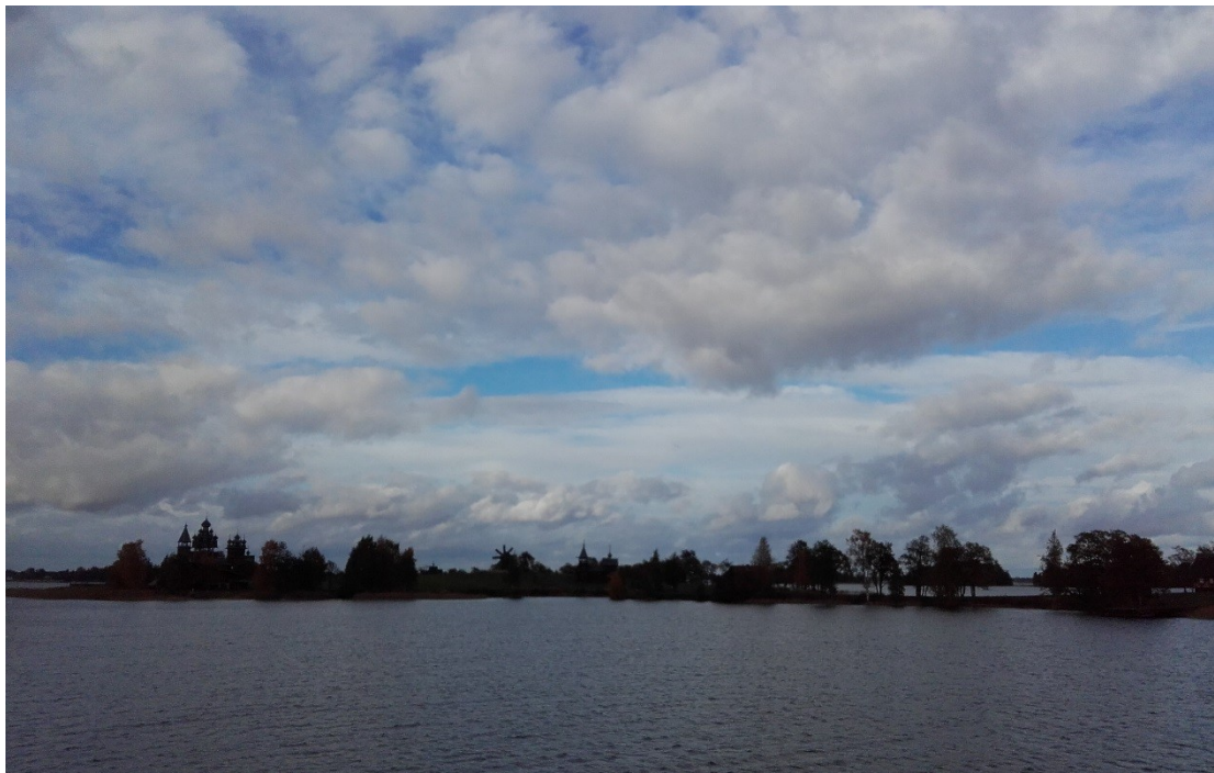
View from the lake Onega.