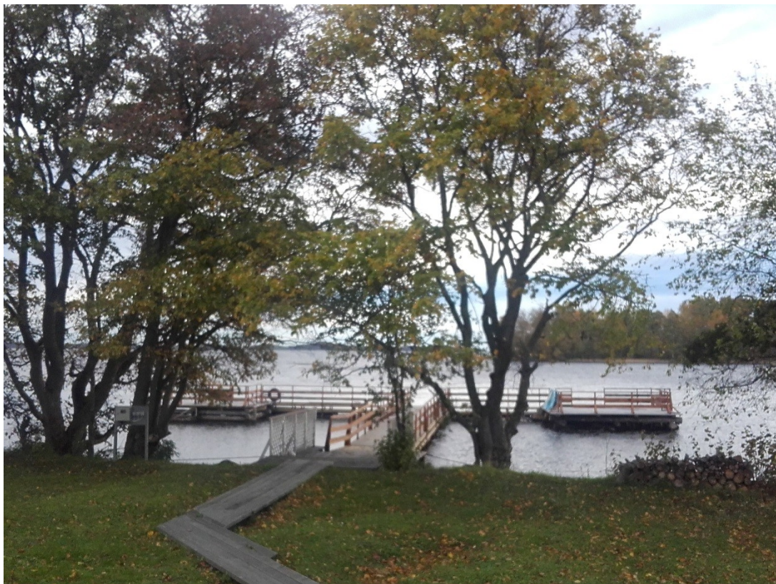
The new pier on the eastern shore by the guest house.