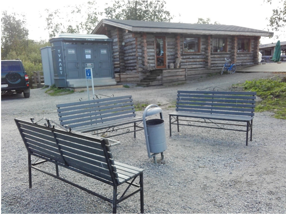
The smoking area by the entrance zone has been moved since last year, and is now in a much safer place, by the lake in a spot with little vegetation or flammable material.